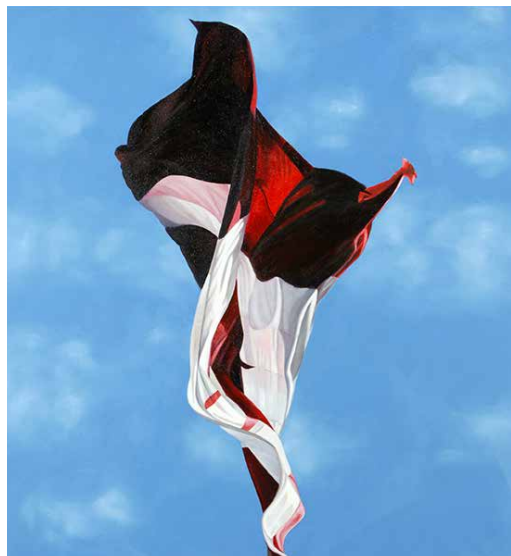
David Garneau, Canadian Flag/Flower , 2005, oil on canvas. Collection of the MacKenzie Art Gallery, purchased with the financial support of the Canada Council for the Arts Acquisition Assistance Program.

Please ensure you are in a space that includes a webcam and microphone. Program Guides at MacKenzie Art Gallery and Remai Modern will be able to virtually come to into your classroom and work directly with students. Basic materials needed are simple drawing materials including paper, pencils and markers.