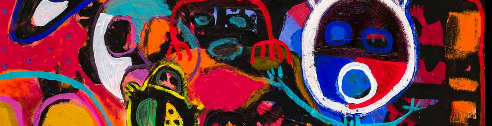
Jane Ash Poitras, Screaming Shaman series (detail), 1994, oil, mixed media. The Mendel Art Gallery Collection at Remai Modern. Purchased with support from the Canada Council's Acquisition Assistance Program, 1996.